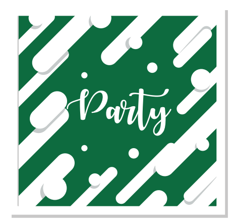
Pro9541 System Five Colour Digital Printing (CMYK + Clear or CMYK + White)