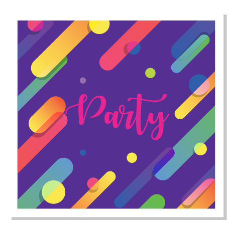
Pro9542 System Five Colour Digital Printing (CMYK + White, CMYK over White in 1 pass)