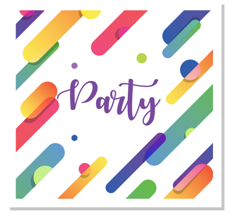
Pro9431 System Four Colour Digital Printing (CMYK)