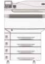
HCF 2,420 sheets