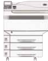
2nd + 3rd Tray with Castor 1,890 sheets