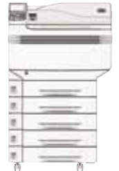
2nd Tray with HCF 2,950 sheets