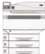
2nd + 3rd Tray 1,890 sheets