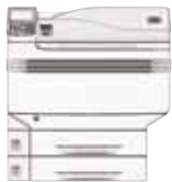
2nd Tray 1,360 sheets