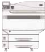
2nd Tray with Castor 1,360 sheets